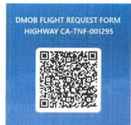
Flight Request Form