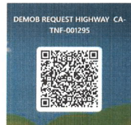
Demob Request Form