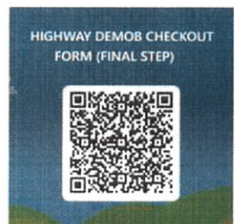
Demob Checkout Form